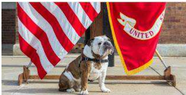
Chesty XV is retiring after three years in service.

Chesty XVI is reporting for official Marine Corps mascot duty as Lance Cpl. Chesty XV retires.