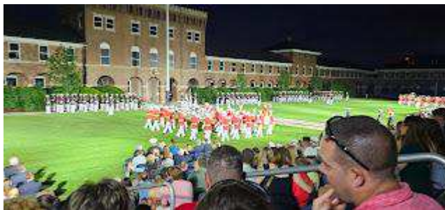
The grand finale started with a concert by the President's own & a firing of the cannons.