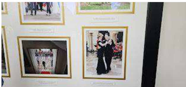
President Reagan dancing with Princess Diana in 1985